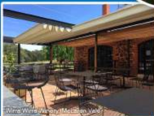
Wirra Wirra Winery, McLaren Vale