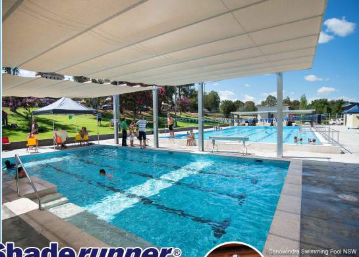
Danowindra Swimming Pool NSW