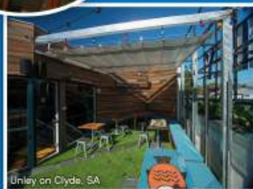
Unley on Clyde, SA