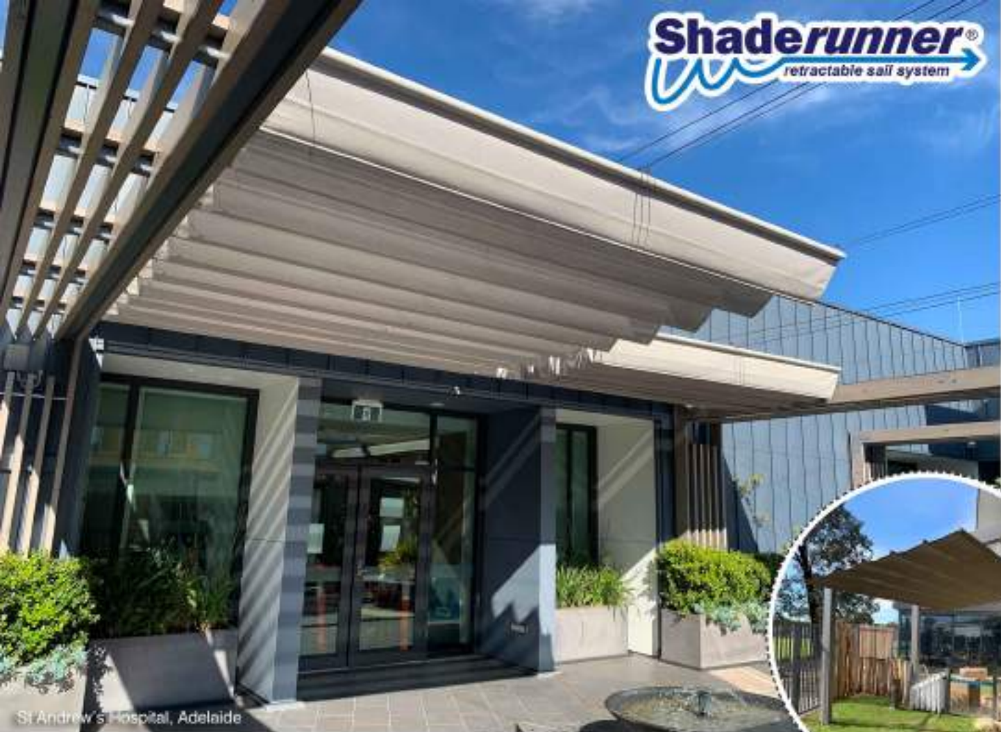
St Andrew's Hospital, Adelaide