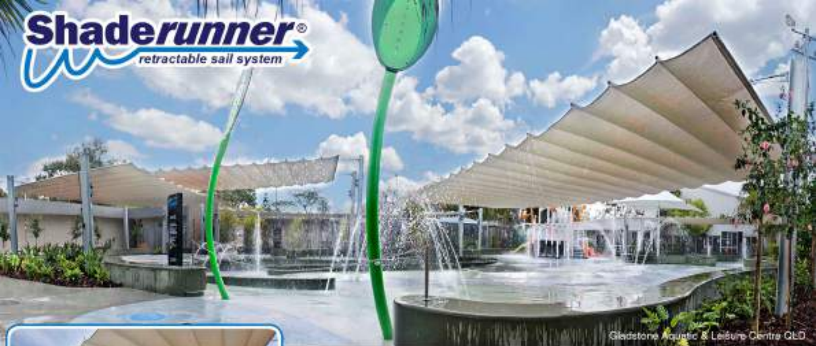
Gladstone Aquatic & Leisure Centre QLD