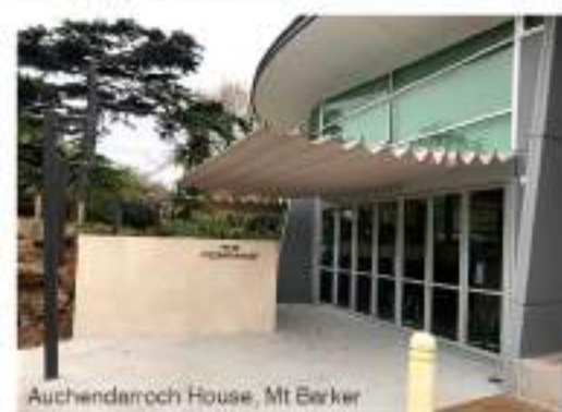
Auchendaroch House, Mt Barker