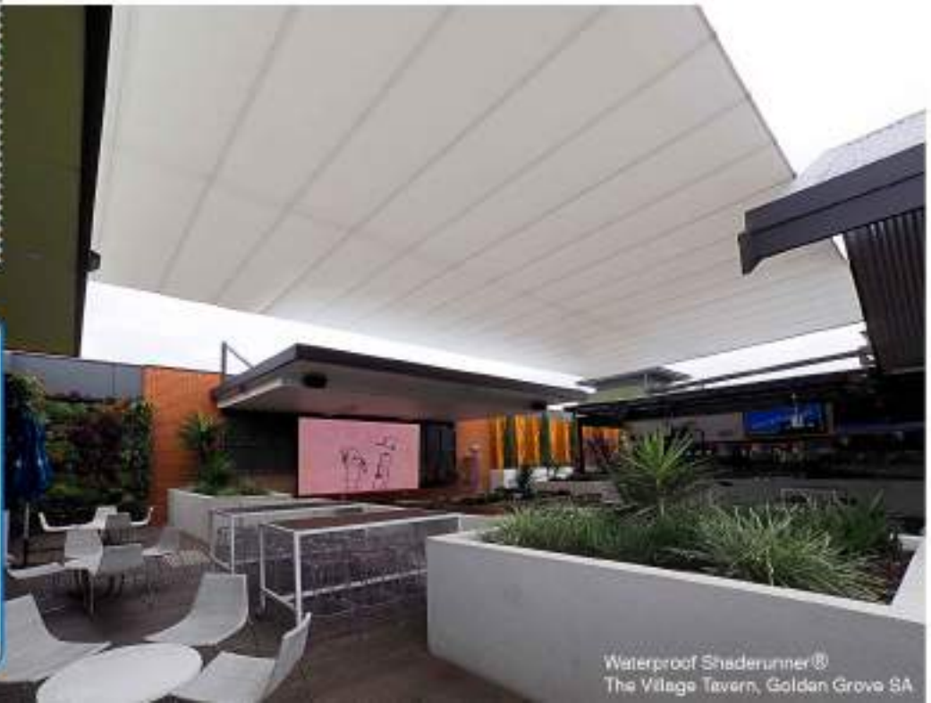
Waterproof Shaderunner® The Village Tavern, Golden Grove SA