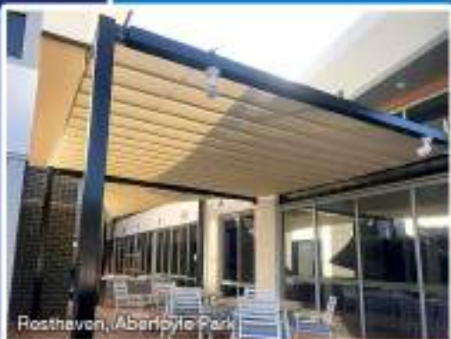
Resthaven, Aberfoyle Park