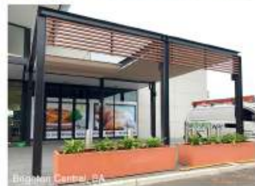
Brighton Centre, SA